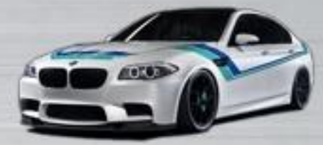
BMW F Series Coding