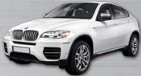
BMW OBD Key Match