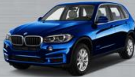
CAS3 Key Match