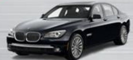
BMW F Series Program