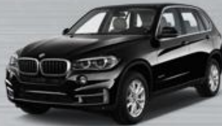
CAS4 Key Match