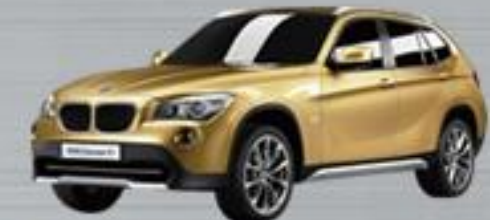
BMW Enable/Disable key