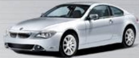
FEM/BDC Key Match